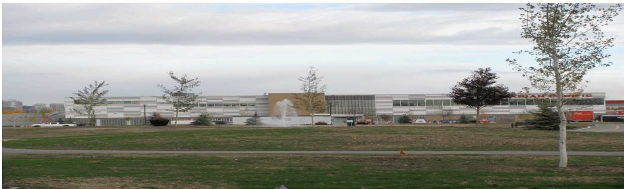
Figure 1 New Head Office Facilities