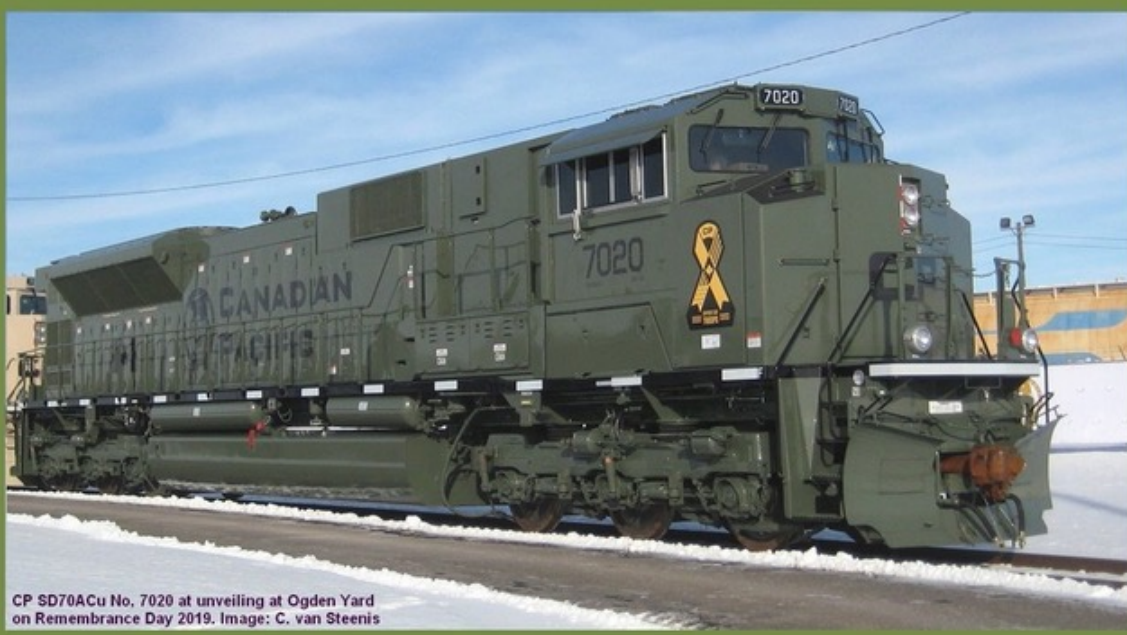
CP SD70ACu No. 7020 at unveiling at Ogden Yard on Remembrance Day 2019.