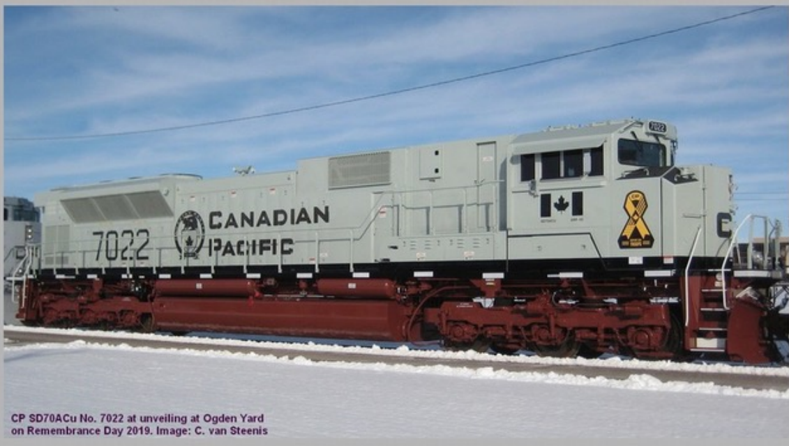
CP SD70ACu No. 7022 at unveiling at Ogden Yard on Remembrance Day 2019.