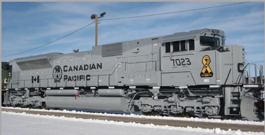
CP SD70ACu No. 7023 at unveiling at Ogden Yard on Remembrance Day 2019.