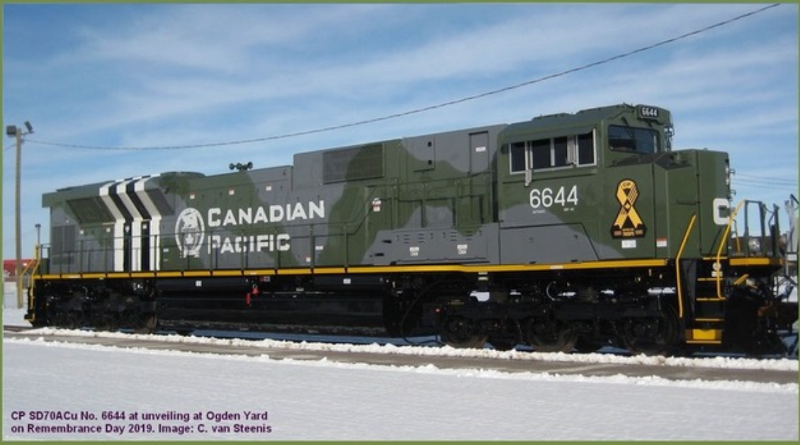
CP SD70ACu No. 6644 at unveiling at Ogden Yard on Remembrance Day 2019.