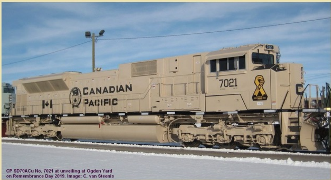
CP SD70ACu No. 7021 at unveiling at Ogden Yard on Remembrance Day 2019.